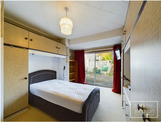
Bedroom 1 13'11" x 10'9" (4.26 x 3.28)

Double glazed patio doors leading out to rear garden, radiator.