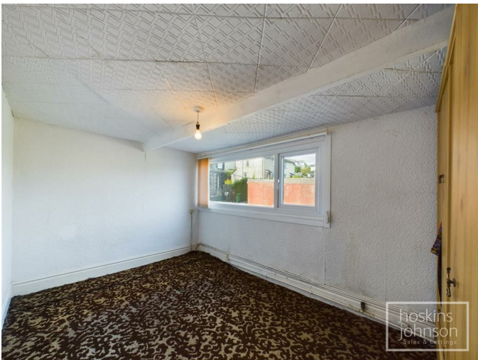
Bedroom 3 12'11" x 7'10" (3.96 x 2.39)