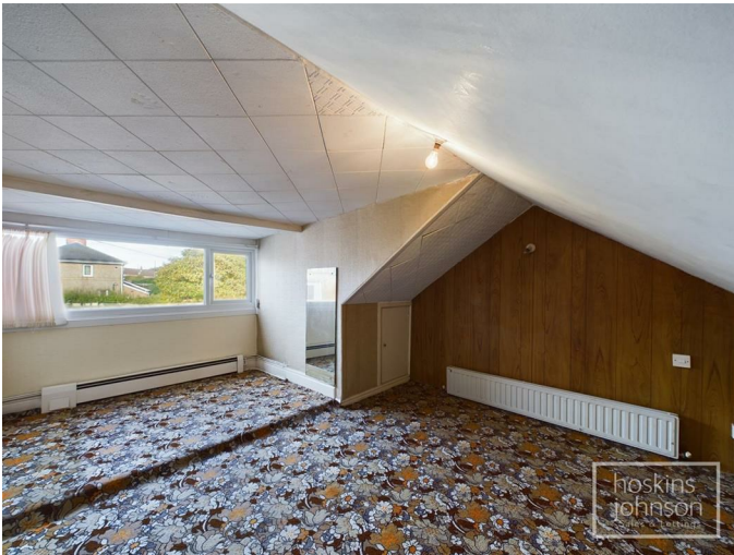
Bedroom 2 11'8" x 9'5" max (3.57 x 2.88 max)